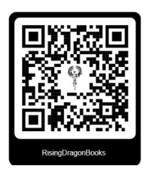
Keep an eye out for the NEXT book in the Knightess of the Realm series An All-Too-Unexpected Revelation

Available at fine online bookstores everywhere in December 2023